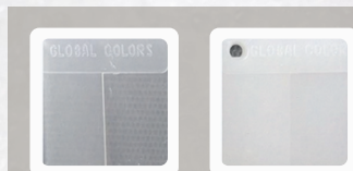
Non-nucleated PP \beta -nucleated PP

Increased opacity and white color of \beta -nucleated PP-h (with 5% NC191) versus non nucleated virgin PP-h