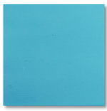
PEARL BLUE PMMA R8606