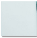
PEARL WHITE PMMA 17-0025