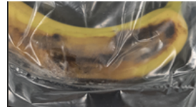
PACKED IN LDPE FILM WITHOUT ADDITIVES

Banana samples packed with LDPE film without additives and LDPE film with 4% Kritilen® EA 51 - DAY 16