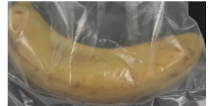
PACKED IN LDPE FILM CONTAINING 4% KRITILEN® EA 51