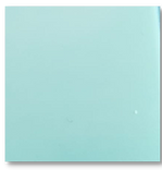
PEARL GREEN PMMA R8608

Swimming pools made of acrylic can achieve higher durability compared to pools made of fiberglass-reinforced polyesters. The extrusion and thermoforming capacity of acrylic sheets can now reach dimensions of up to 4x12m and is considered a game changer for products made of thermoformed acrylic polymer. For this end application, we developed special, pearlescent colors in different shades that offer high-end aesthetic and a sense of luxury and elegance.